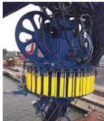
300 clips / every 10 meter / including 10 meter heave compensation