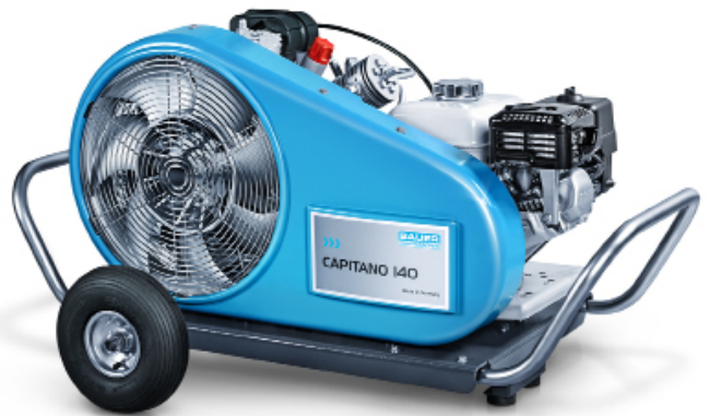
CAPITANO 140 with petrol engine and trolley