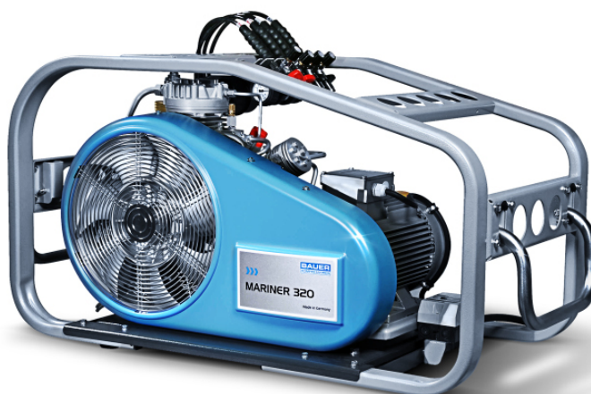
MARINER 320 with electric motor, 4 filling hoses (standard) and 2 pressure ranges (optional)