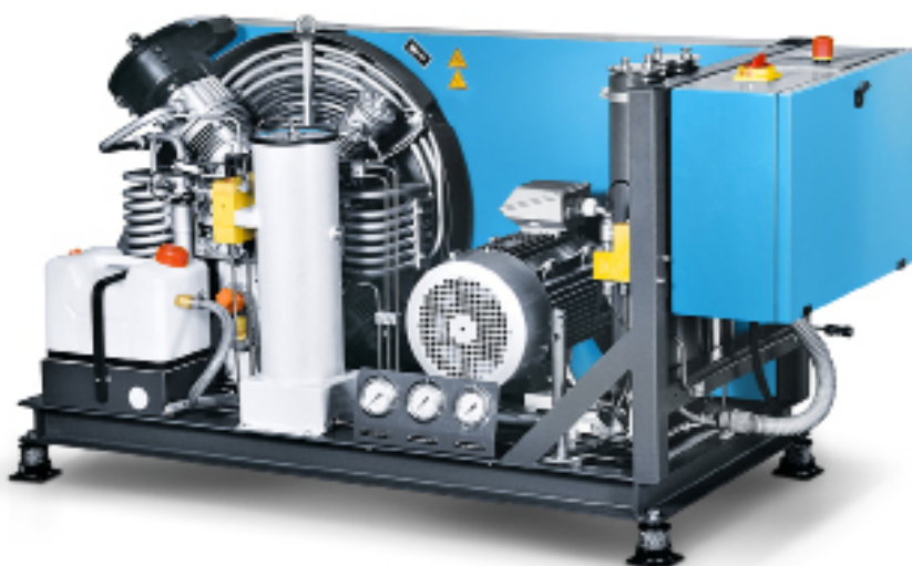
KAP-H compressor unit